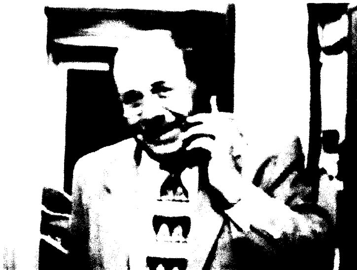
Mayor Joseph Delfino: America's Favorite Mayor.

Nominated by a number of write-ins from across the country and locally was the city's own Elena Sassower, who was released December 24, after serving a six-month jail sentence for being convicted of Disruption of Congress.