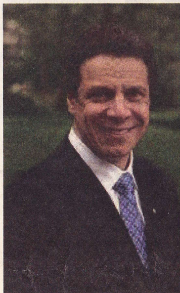
Governor Andrew Cuomo

law-breaking around member items and minor political deals. They're wrong and illegal. But the big problem, the one that affects all of us, the systematic corruption, is the perfectly legal behavior that transfers hundreds of millions of dollars from wealthy special interests to candidates. The heavy hitters weave a web of obligation and influence around decisions made by the governor, state agencies, the comptroller and the attorney general. Perfectly legal. And corrupt, in the sense that the big boys get their way.