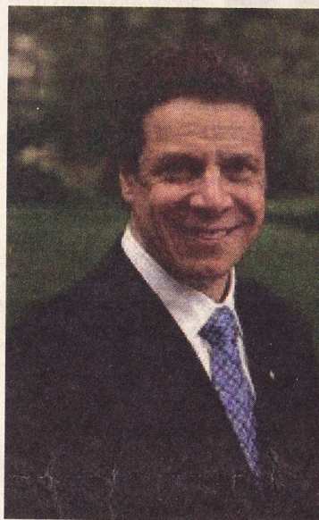
Governor Andrew Cuomo

The political process will eventually address the hypocrisy and lying. The primary and general election campaigns will seize on them, as they should. The governor will sooner or later face the