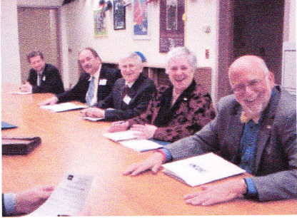
The Organization of NYS Management Confidential Employees