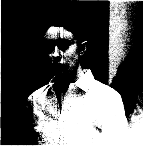
• Casey Anthony Found Not Guilty Of Killing Her Daughter